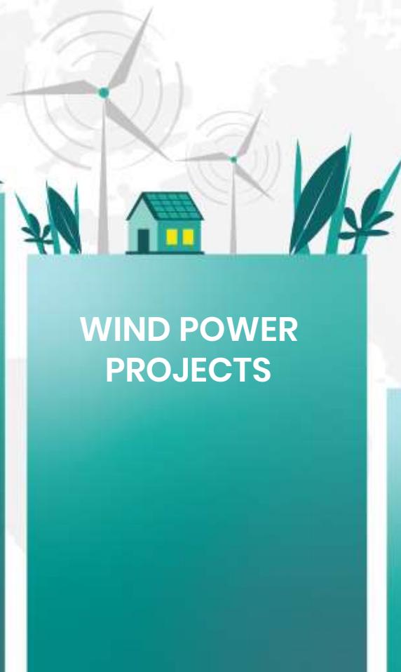
WIND POWER PROJECTS