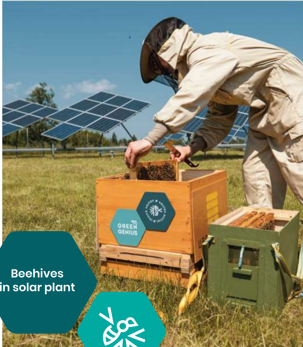
Beehives in solar plant