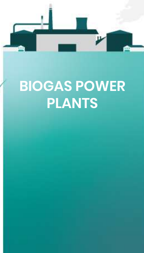
BIOGAS POWER PLANTS